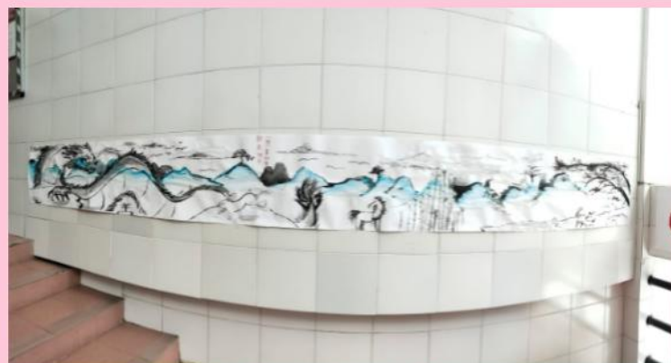
Winning Scroll of Grade 9 Newton