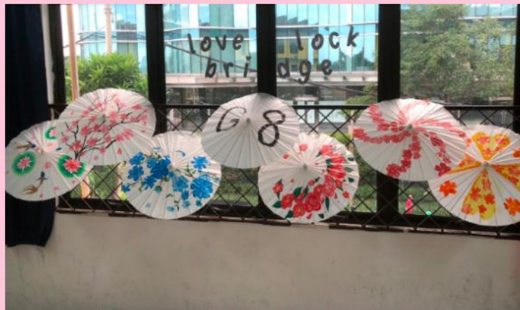
Winning Umbrellas of Grade 8 Einstein