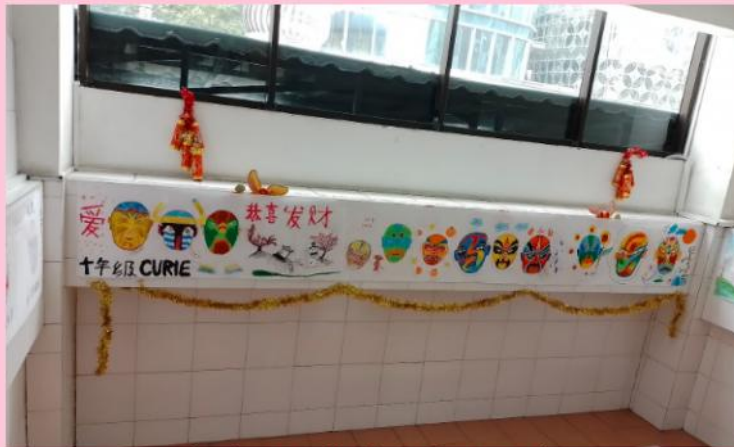
Winning Scroll of Grade 10 Curie