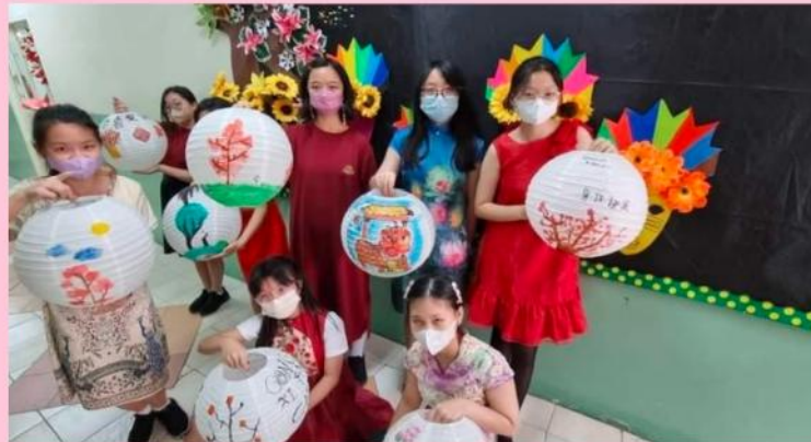
Winning Lanterns of Grade 6

After the break, several grade levels had different activities to do with competition among all classes within each grade level. Grades 6 and 7 painted lanterns, Grade 8 painted umbrellas, while Grades 9 and 10 had scroll paintings. The winners of each grade won a box of goodies- including snacks, and drinks.